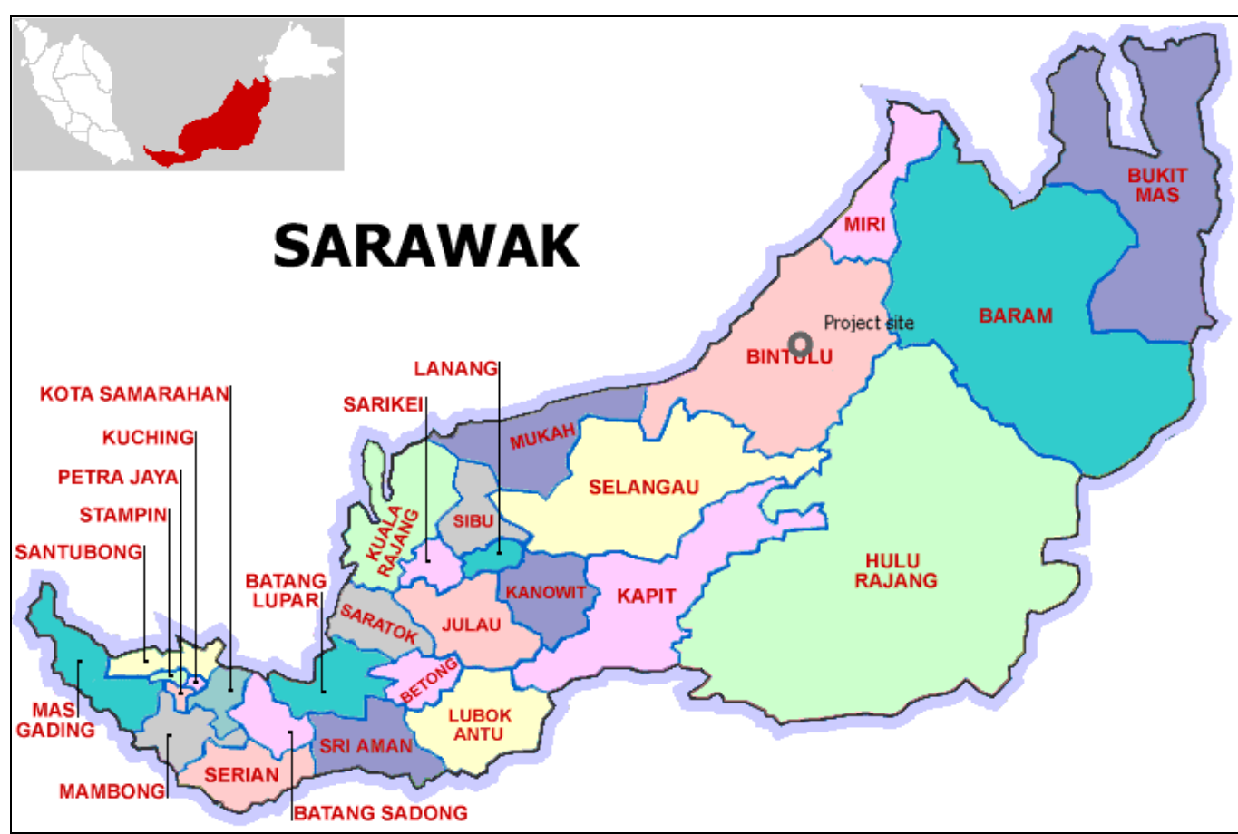
Figure 1: Location of the projects site in Sarawak, Malaysia.